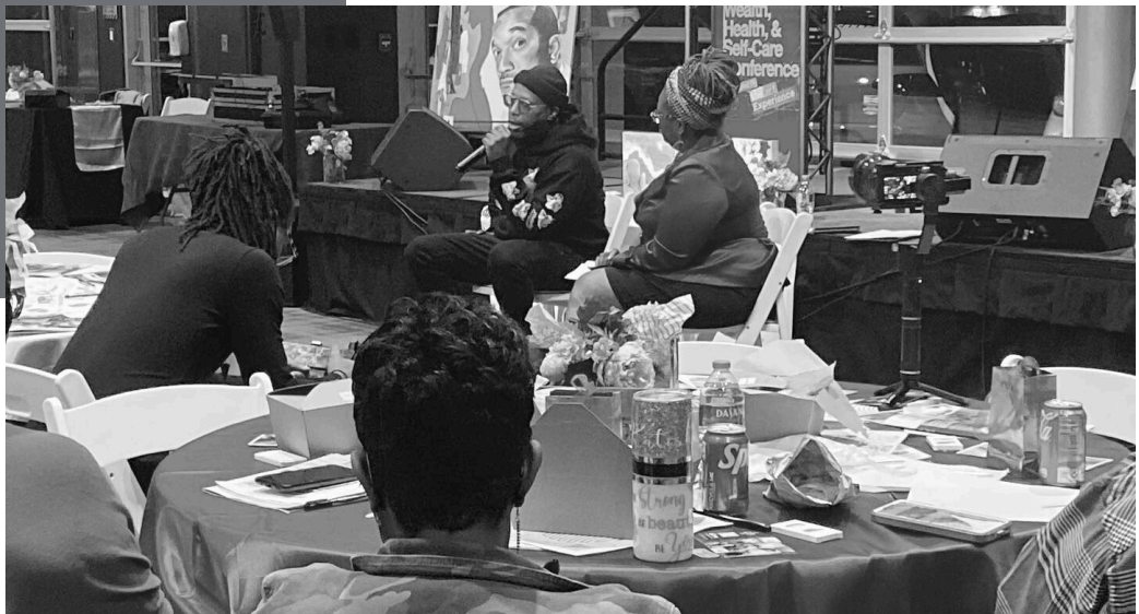
Photo: 1st Wealth, Health, & Self Care Conference THURSDAY, OCTOBER 13, 2022 c/o Washington Event